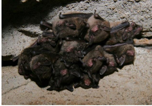
Figure 2. A cluster of Indiana bats in Hubbards Cave in 2009