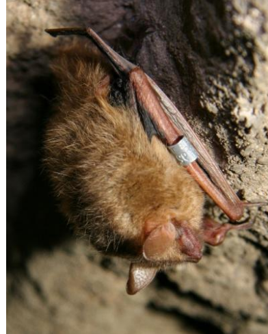
Figure 6. A tri-colored bat banded in Rice Cave in 2010

In addition, the appropriate agency and individuals will respond to any reports from the public of WNS symptoms in caves or the surrounding landscape to assess the reported situation.