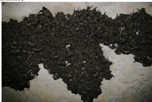
Figure 3. A cluster of gray bats in Hubbards Cave in 2009

All biologists conducting bat surveys in Tennessee adhere to guidance presented in the most recent disinfection protocol from the USFWS ( http://www.fws.gov/WhiteNoseSyndrome/ ). Any equipment used in a WNS positive cave is dedicated to use only in WNS caves.