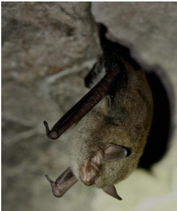
Figure 9. A healthy Indiana bat in Tobacco Port Cave in 2009

WNS-infected and non-infected bats will be banded at these caves and any other newly documented occurrences. Observation of banded bats in years following initial mortality events, combined with additional banding in late spring once a site is found to be affected, could provide conclusive evidence whether some individuals are able to survive exposure to an environment shared with other WNS affected individuals. Additionally, the surface temperature of the cave wall near the roost will be recorded.