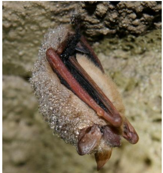
Figure 7. A healthy tri-colored bat in Tobacco Port Cave in 2009

WNS was confirmed in six caves (Table 5, Figure 4) and three species (Figures 7-9) beginning in February of 2010. These caves will be monitored to document the level of mortality in the winter of 2010/2011 (Table 6).