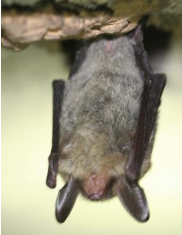
Figure 8. A healthy N. long-eared bat in Tobacco Port Cave in 2009