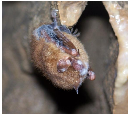
Figure 1. A WNS positive tri-colored bat from Worley's Cave in February 2010.